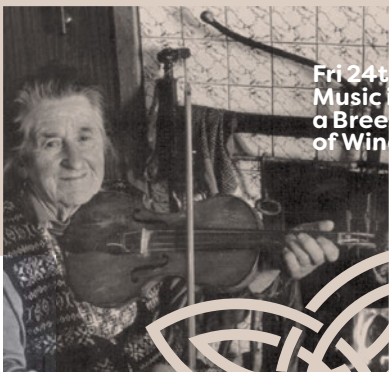
Fri 24th Nov Music in a Breeze of Wind

Montague Burton Resource Centre Banstead Street West, Roundhay Road LEEDS LS8 5RU